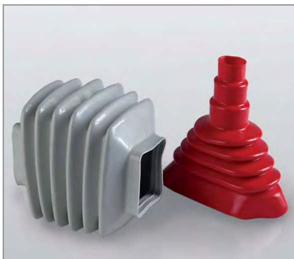
Large variety of forms and colours

Tooling is already available for many configurations, therefore attractive prices can be offered even for smaller quantities. The dimensions and shapes shown in the catalogue are available as standard forms. In addition we would be pleased to assist you in the design of special types.