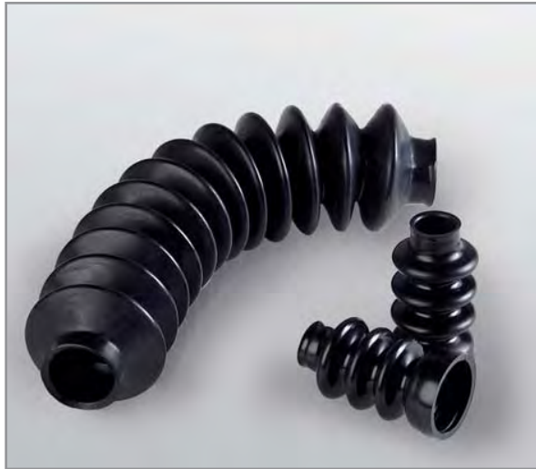
Soft PVC Bellows in standard colour black

Soft PVC Bellows occupy a special position among the different types of bellows. ELASTIC Bellows (see Chapter ELASTIC Bellows) offer extremely flexible design options with regard to material, dimensions and shape and can nevertheless also be produced economically in very small quantities.