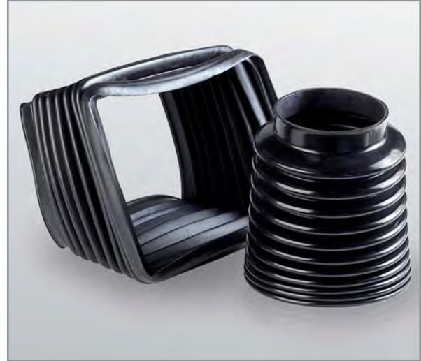
Soft PVC bellows in circular and rectangular form

All dimensions in mm if not marked otherwise. Errors and omissions excepted.