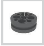
VCG 22/28/36/48/56/70 Cable End Finishing

RKD is also tube ball joint like RKS, however, its shape is a little bit different as ball joint direction is bidirectional unlike RKS.