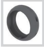
RKTP-22/28/36/48/56/70 Abrasion Protection Connector

RKR in combination with RKC is to release tube's tension and fatigue as it can rotate with robot-arm movement.