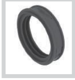
RKSC 22/28/36/48/56/70 Strain Relief Insert

RKC is tube clamp in combination with RKS+RKRC or RKD+RKRC to holds tube's movement while robot operates.