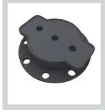
RKR-22/28/36/48/56/70 Rotating Connector

22-36 of RKSC : It clamp for VCG, 48-70 of RKSC : It clamp for Tube and RKS.