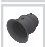
RKS-22/28/36/48/56/70 Tube Ball Joint

If robot tube got damaged such as cut or stretched condition, you don't need to replace total tube by using RKTC as it can cover damaged area.