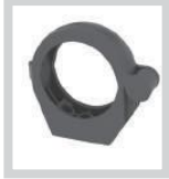
RKC 22/28/36/48/56/70 Tube Clamps

VCG is clamp for robot cables/hoses at end position of tube.