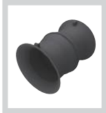
RKD 22/28/36/48/56/70 Tube Ball Joint Sleeve

RKD is also tube ball joint like RKS, however, its shape is a little bit different as ball joint direction is bidirectional unlike RKS.