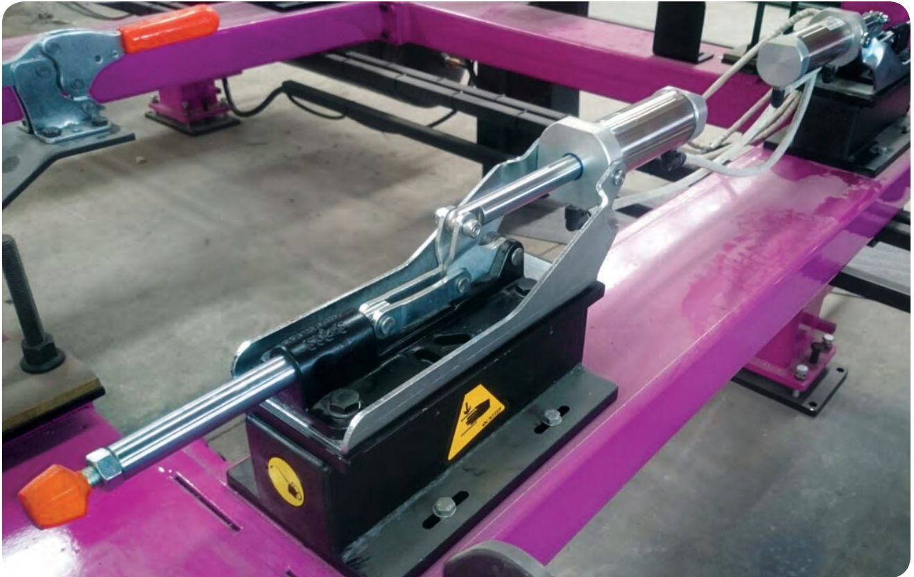
Pneumatic cylinders are double acting, magnetic and cushioning