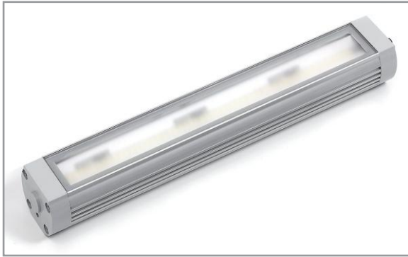
HE-TRACK-ALPHA - diffuse light emission for glare-free work

The HE-TRACK-ALPHA LED machine lights are suitable for small and medium-sized machine tools. The housing is made of robust, silver anodized aluminum.