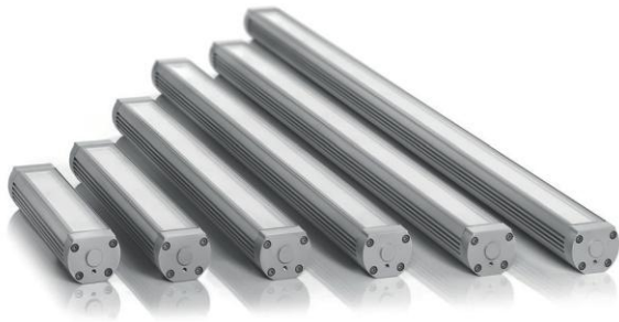
HE-TRACK-ALPHA LED machine light series

The HE-TRACK-ALPHA LED machine lights are extremely low maintenance thanks to the long life of the LED technology of about 50,000 operating hours.