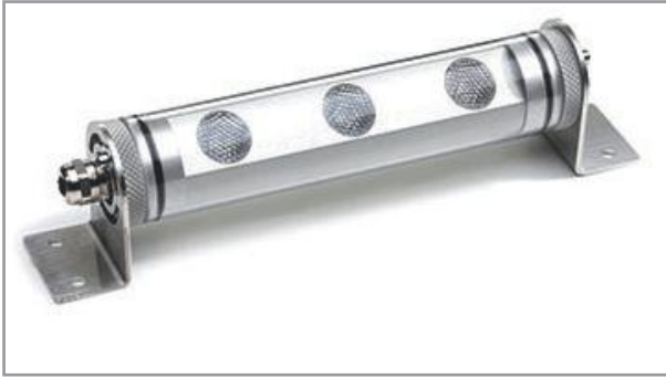
Machine interior lighting HE-T-LED mit mounting brackets

The housing of the HE-T-LED is made of aluminum with a coating of polycarbonate.